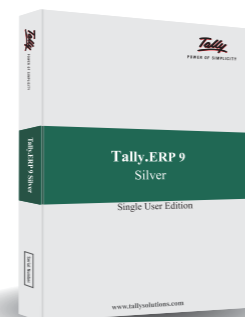
Tally.ERP 9 Silver Single User MRP INR 18,000.00 (Inclusive of taxes)